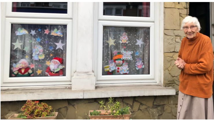
Kitty's Christmas window